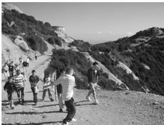
Barcelona Trip - Montserrat

In the interim they will be incorporated into the display and tenor drum corps of the band. This will afford them the opportunity to improve on their musical timing and marching skills while at the same time participating in band events.