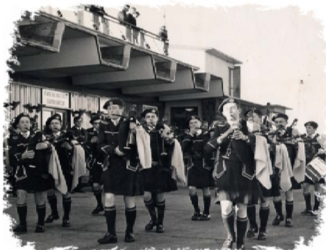
At Shannon Airport in 1965

I would like to take this opportunity to welcome all new recruit members and also to thank the senior members for their continuing dedication and commitment to the band.