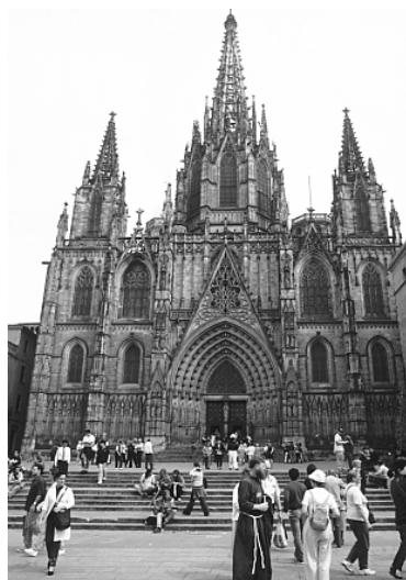
Cathedral of Barcelona (La Seu)