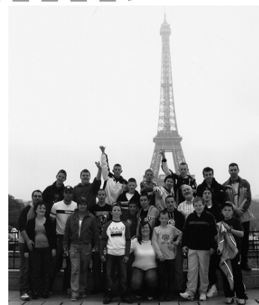
Band members in Paris 2005

Note that the financial value of Band Travel Credits is not transferable or refundable in any way and can only be used by a band member towards band travel events.