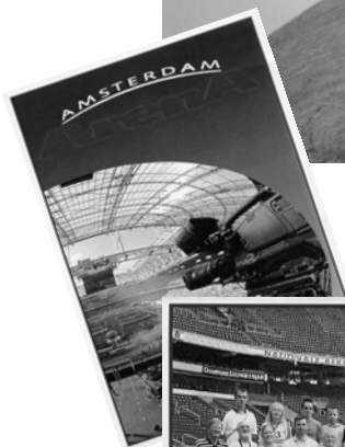
Below: Holland - Ajax Stadium Amsterdam, Zaanse Schans and Volendam