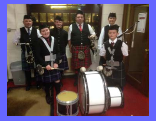
Members of the Alumni Band welcome guests to the Colaiste Mhicil Open Night on 1st October 2013

On 7th November 2013 members of the Alumni Band together with members of the youth band tcombined for a photo shoot at King John's Castle.